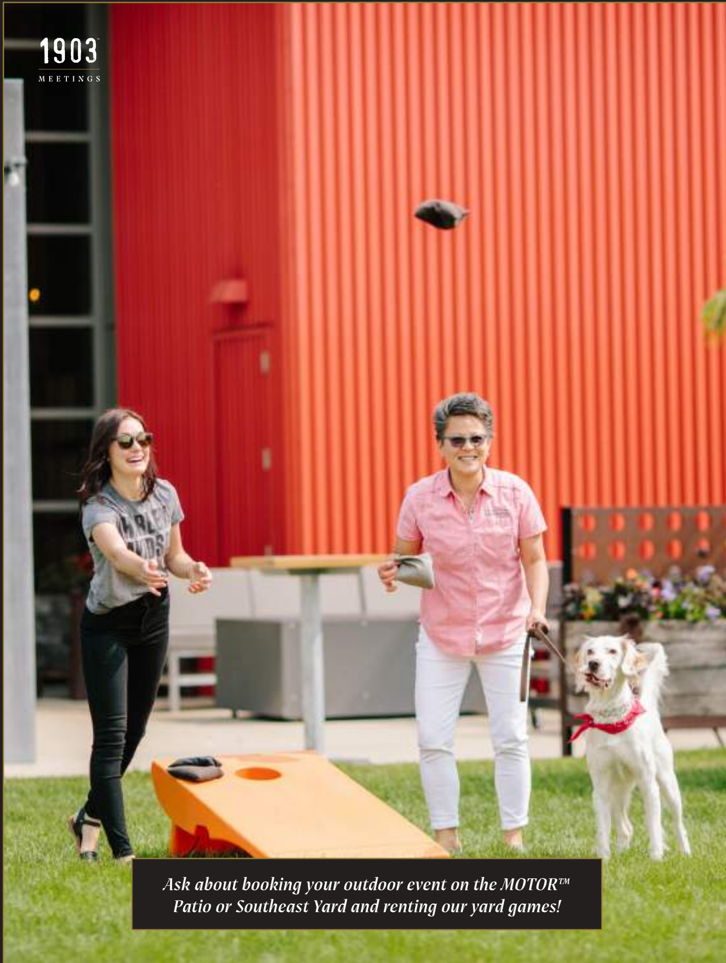
Ask about booking your outdoor event on the MOTOR™ Patio or Southeast Yard and renting our yard games!