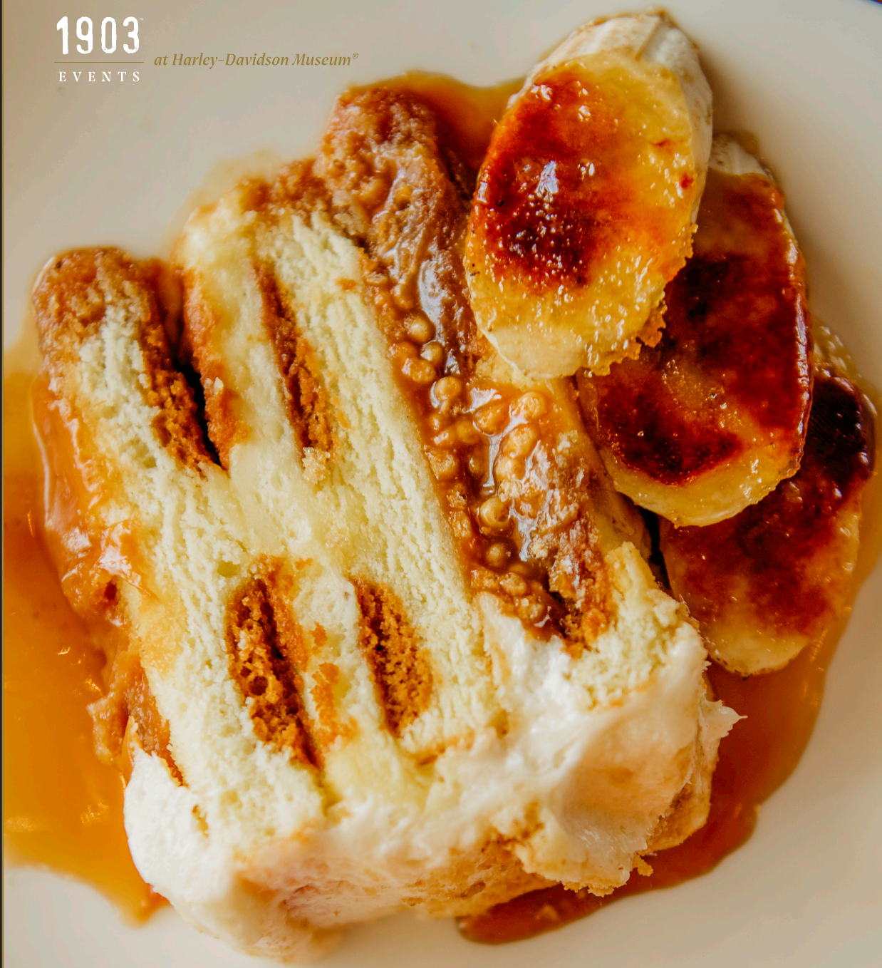
Bananas Foster Cake